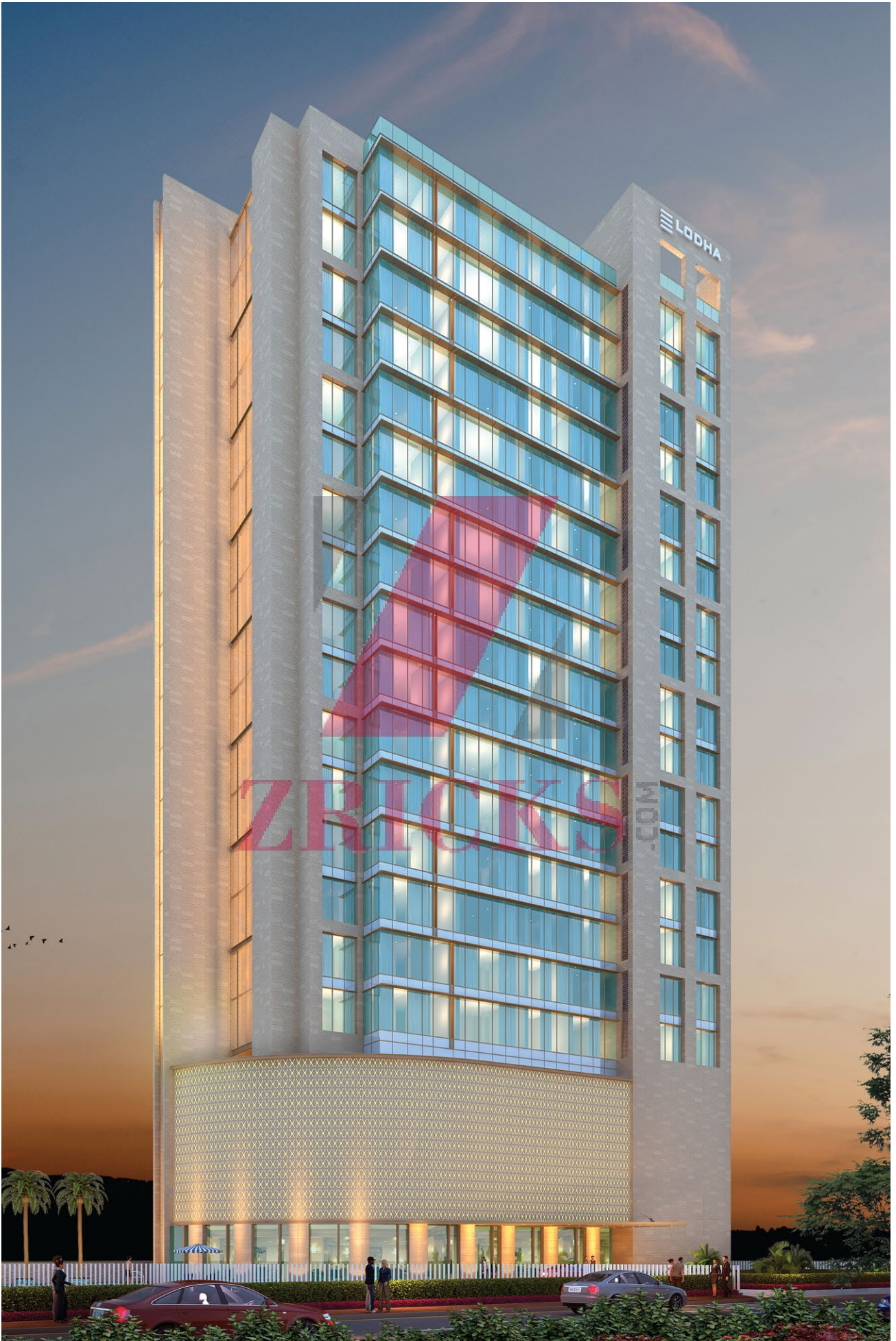
Artist's rendering of Codename Seaview